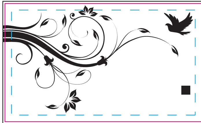
White Ink Plate

Black line is bleed size 92x56mm. Please make sure all objects are within this area. We cannot print if there is anything larger then this area.